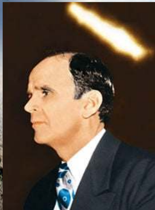
WILLIAM M. BRANHAM ELIJAH-PROPHET